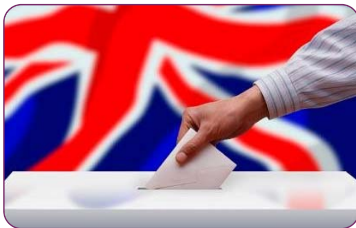
After the election comes the pain of paying for so much borrowing

Responsibility to say whether he is achieving his targets or not.